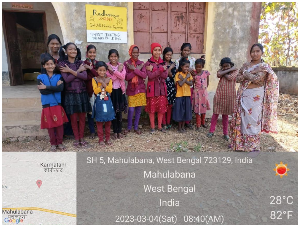
Celebration of International Women's Day, Radhanagar LC Purulia