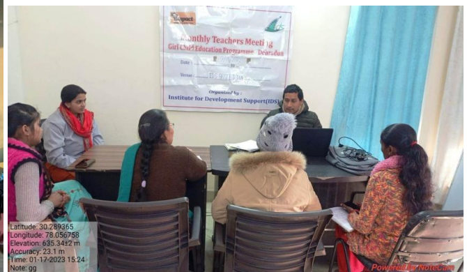
MTM Doiwala Cluster